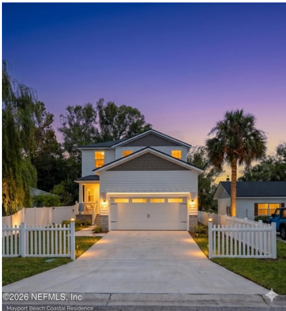
Mayport Beach Coastal Residence